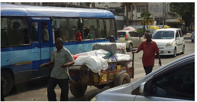
Delivering people and goods in Dar es Salaam